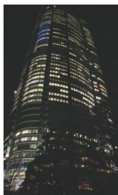
Roppongi Hills Mori Tower

Japan: a country where the old and the new exist side by side. Be steeped in the rich culture and history embodied in Japan's sublime architecture.