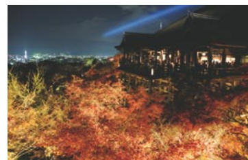
Kiyomizudera in autumn

Approximately 500km west of Tokyo, at the centre of ancient Japan around 1,200 years ago, lies the flourishing city of Kyoto. Kyoto is home to streets that boast hundreds of shrines, temples and other ancient structures, through which a sense of Japan's history can be felt, making it one of the foremost tourist destinations in the world. One of the most popular temples, Kiyomizudera's , main building, lies in a hollow in the mountains, appearing to lean out from an 18 metre cliff. In the spring the cherry blossoms bloom, and in the summer the temple is surrounded by the bright green of the trees. The autumn brings the changing colours of the leaves, and in the winter the scene is shrouded in snow. Each of the four seasons brings a special beauty to be enjoyed.