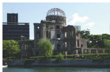
Genbaku Dome

Located about 400km west of Kyoto, Hiroshima is known as the site of the first nuclear weapon deployed during war, on August the 6th, 1945. Built in 1914, the Hiroshima Prefectural Industrial Promotion Hall was the site of numerous expositions that attracted great numbers of people. However, the hall is now known by its common name, the 'Atomic Bomb Dome', a ruin that wordlessly conveys the devastation caused by the atomic bomb. The facade of the building remains, with a five-storey staircase leading to the copper-plated elliptical dome, architecture that was both modern and exceptional in pre-war Japan. Being a mere 160 metres from ground zero, exposed to the blast and the heat it generated, the rooftop, flooring, and the majority of the walls disintegrated, leaving the stripped steel cage of the dome miraculously spared from destruction. Currently listed by the UNESCO World