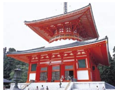
Konpon Daito in Koyasan