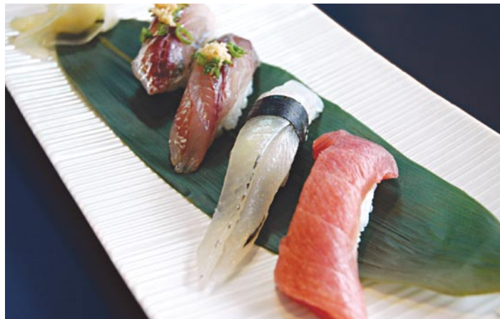
Eating sushi in luxury at the counter

sushi that appeals to them, eating only what they choose, and, as the prices are pre-arranged according to the colour of the plate, the bill can be precalculated. At this kind of semi-self-service sushi bar, considering that customers can eat immediately, one could even go so far as to call it the ultimate fast food.