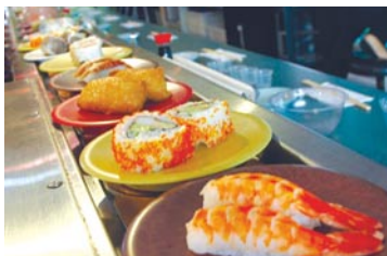
The rotary sushi, which is becoming an increasingly popular way of eating sushi in modern Japan.

As to the origins of sushi, it appears that the current sushi style arose during the Edo period (1603-1867) and during the Meiji period (1868-1912) ice-making technology advanced to a reputable standard. With advances in coastal fishing hauling methods and distribution of fresh produce, improving the environment in which the fresh fish were handled, sushi became available to the general populace. After which, following the Second World War, street stands were abolished for reasons of hygiene, and the sushi store settled into the category of high-class restaurant.